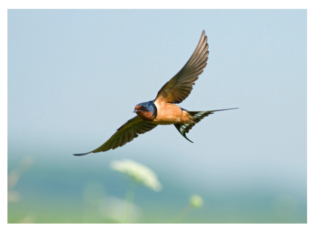
Figure 1 A North American swallow ( H. rustica erythrogaster ) in flight. In North American populations of barn swallows, ventral plumage color is typically darker compared to the European nominate subspecies ( H. rustica rustica ), whereas tail streamers are shorter.