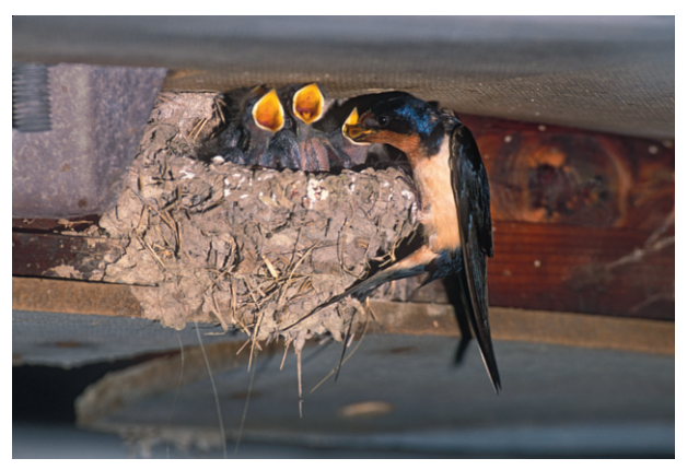
Figure 2 A North American swallow attending young nestlings. Both males and females participate in feeding of shared offspring, although paternity is typically mixed within each brood. Interestingly, the degree to which males participate in incubation varies among subspecies of swallows, males participating to a greater degree in North America compared to Europe.

for assortative mating on the basis of this trait. Long-tailed males produce the most offspring (in their first clutch and total number of young per season) each year because they pair and breed earlier and successfully fledge more broods than males with shorter tails.